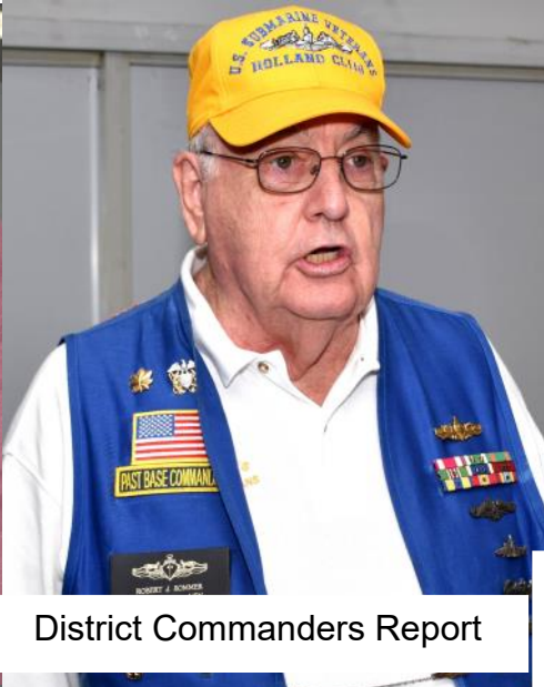
District Commanders Report