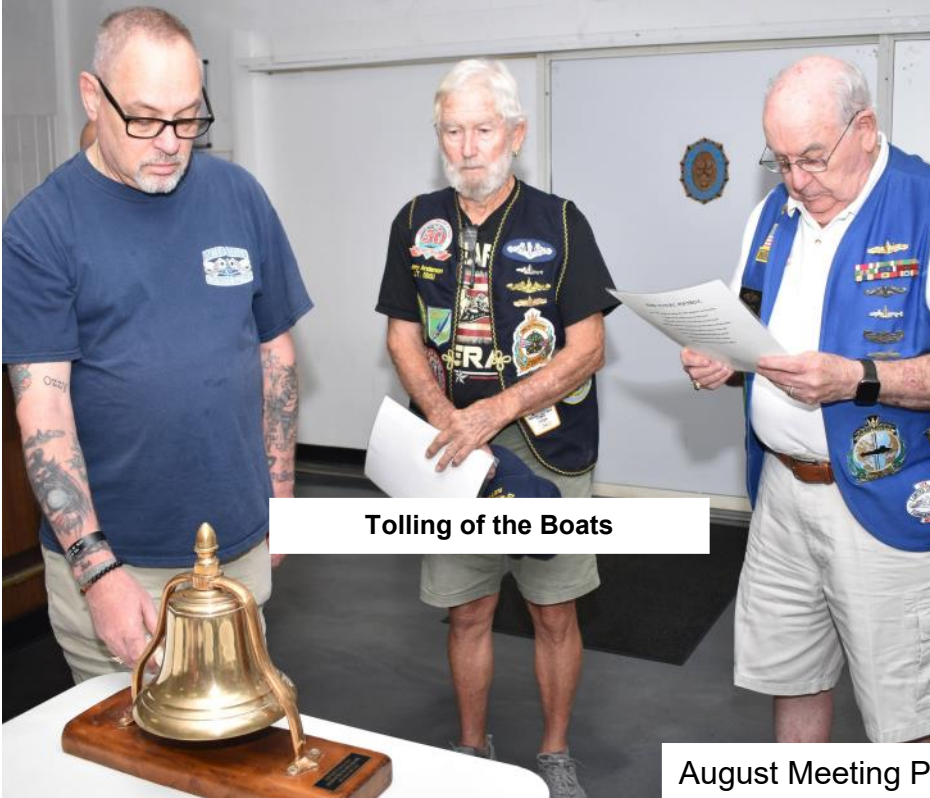
Tolling of the Boats