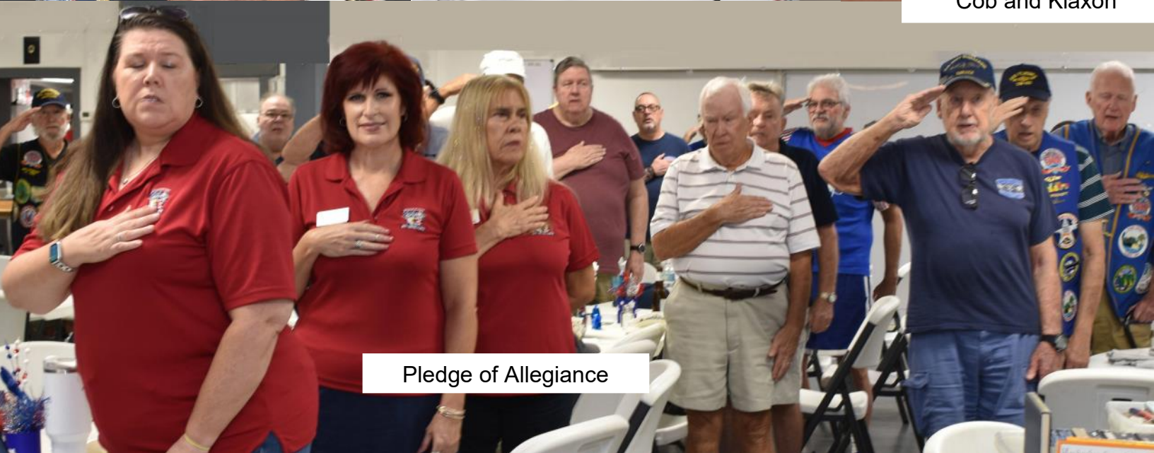
Pledge of Allegiance