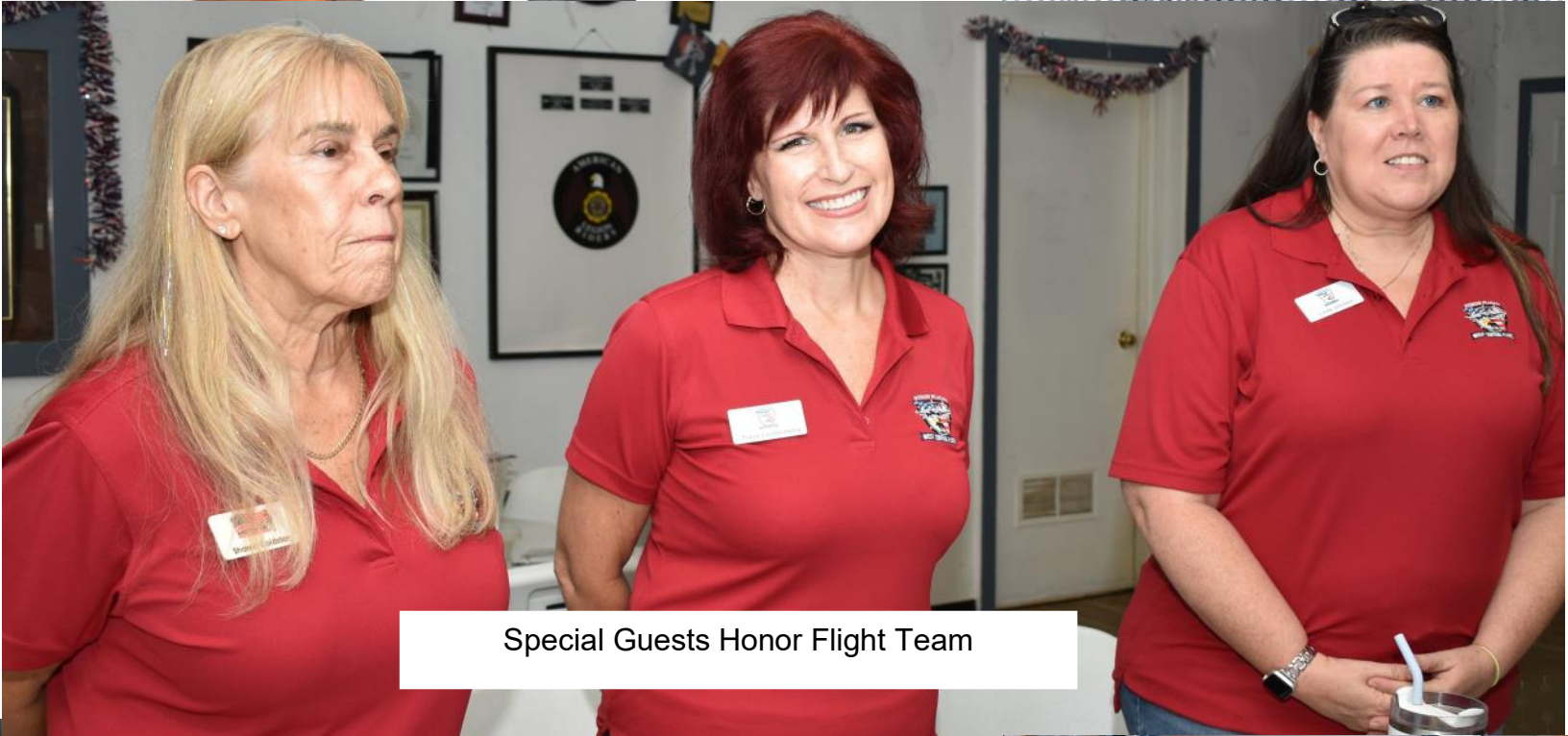
Special Guests Honor Flight Team