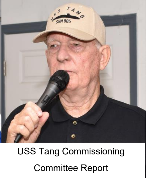
USS Tang Commissioning Committee Report