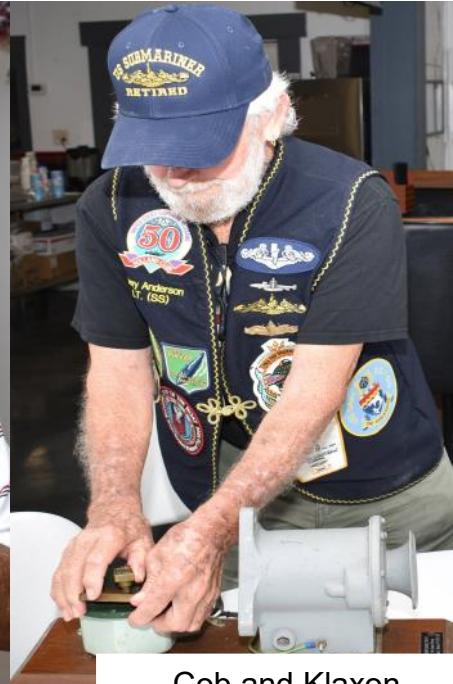
Cob and Klaxon