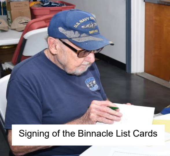
Signing of the Binnacle List Cards