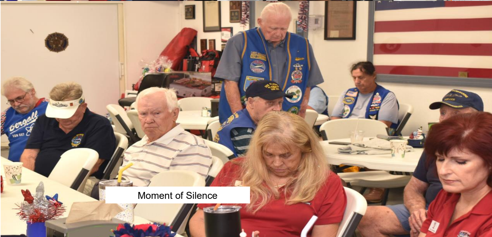
Moment of Silence