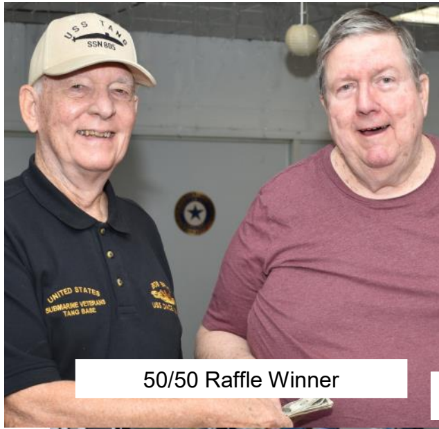
50/50 Raffle Winner