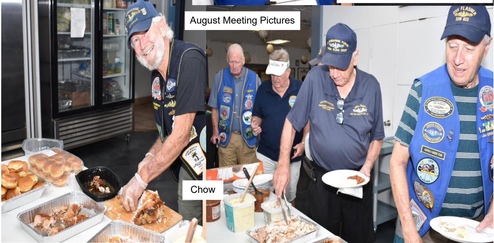
August Meeting Pictures