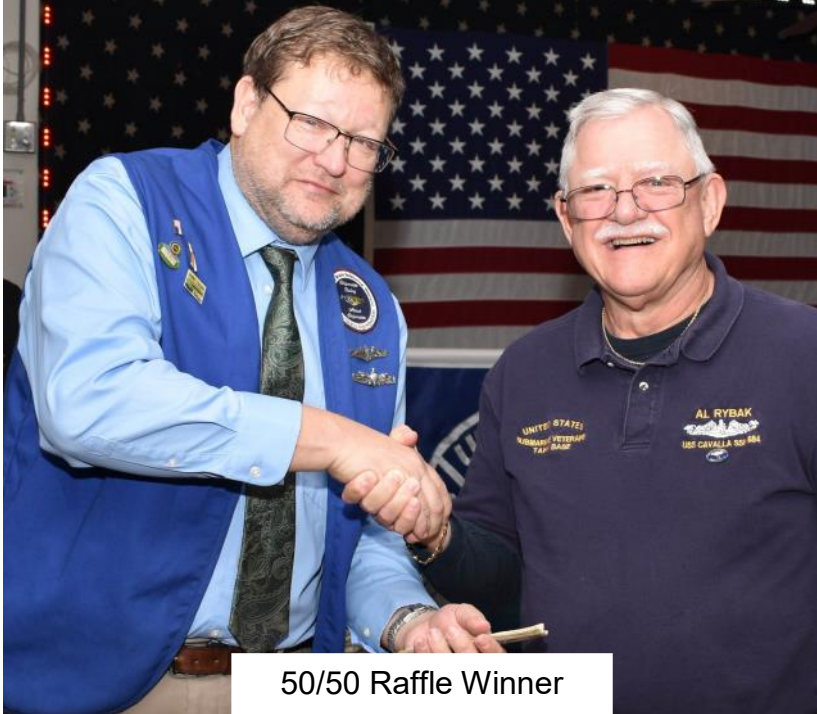
50/50 Raffle Winner