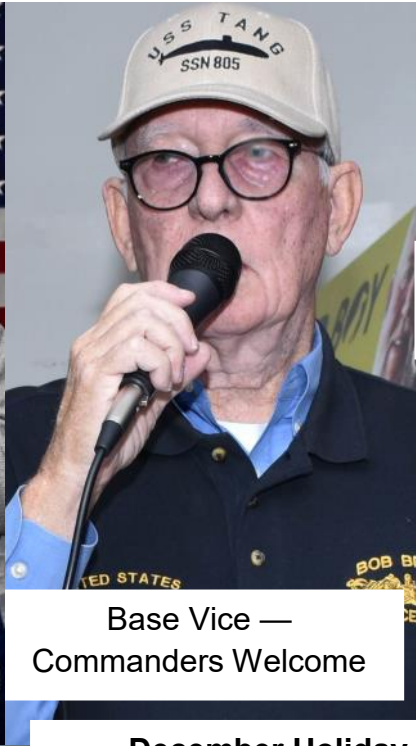
Base Vice — Commanders Welcome