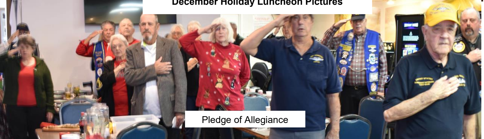
Pledge of Allegiance