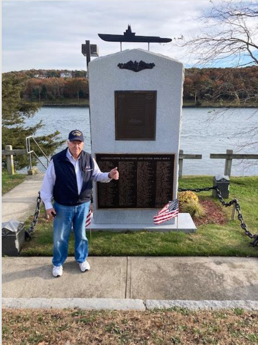
Submarine Memorial on Cape Cod