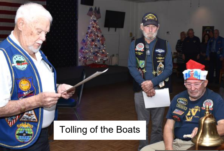
Tolling of the Boats