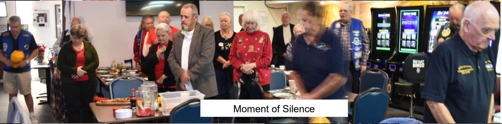
Moment of Silence