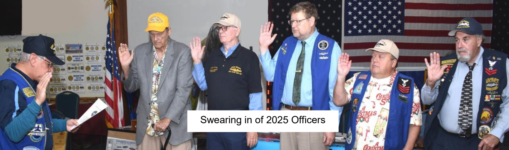
Swearing in of 2025 Officers