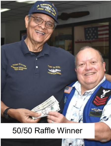
50/50 Raffle Winner