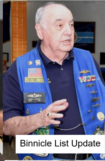
Binnicle List Update