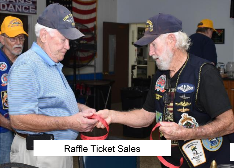
Raffle Ticket Sales