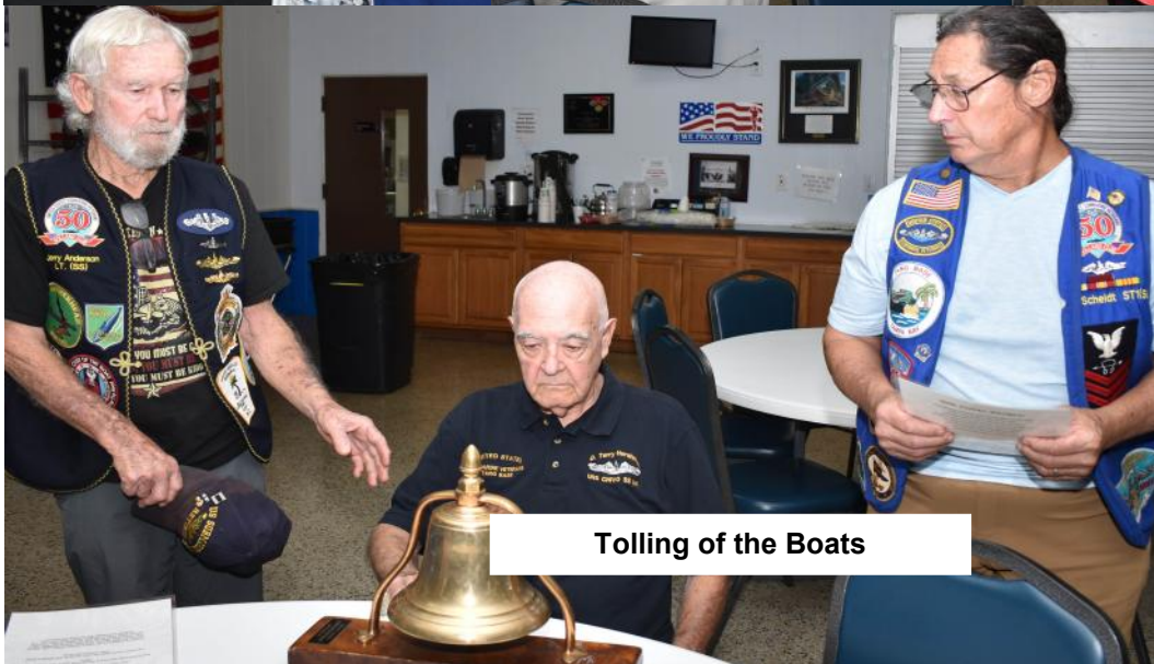
Tolling of the Boats