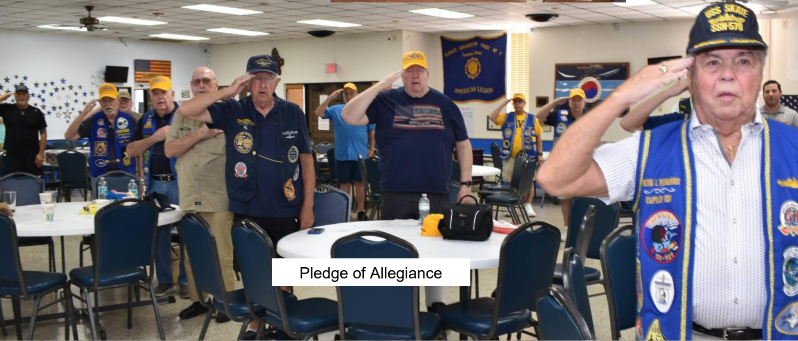
Pledge of Allegiance