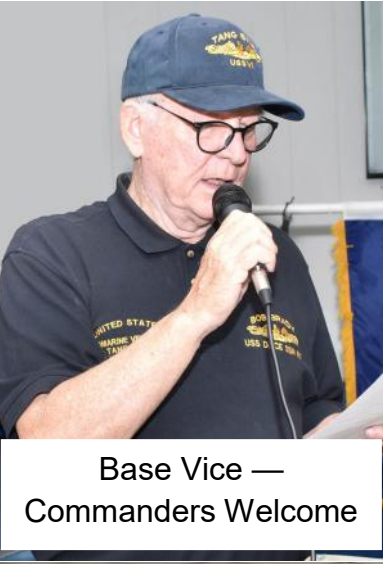
Base Vice — Commanders Welcome