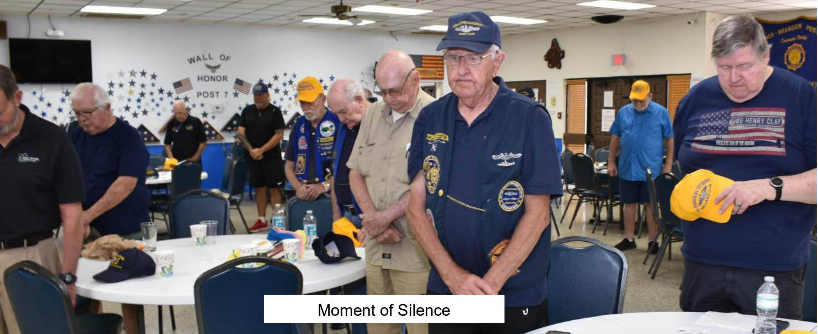
Moment of Silence