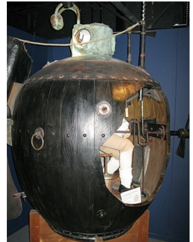
Turtle Model at Royal Navy Museum.