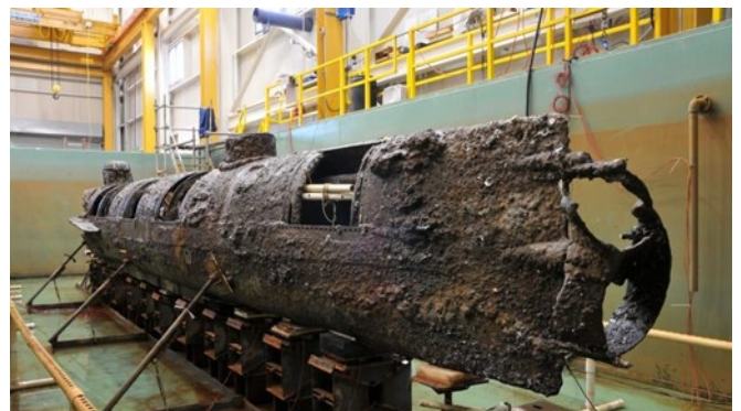
The Remains of the H. L. Hunley.