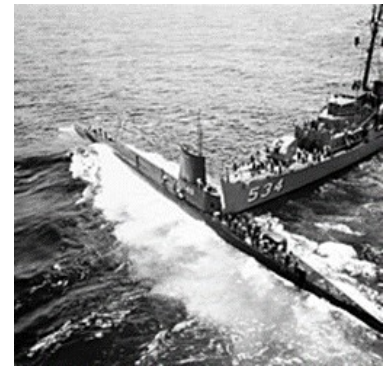
Stickleback Rammed by Silverstein