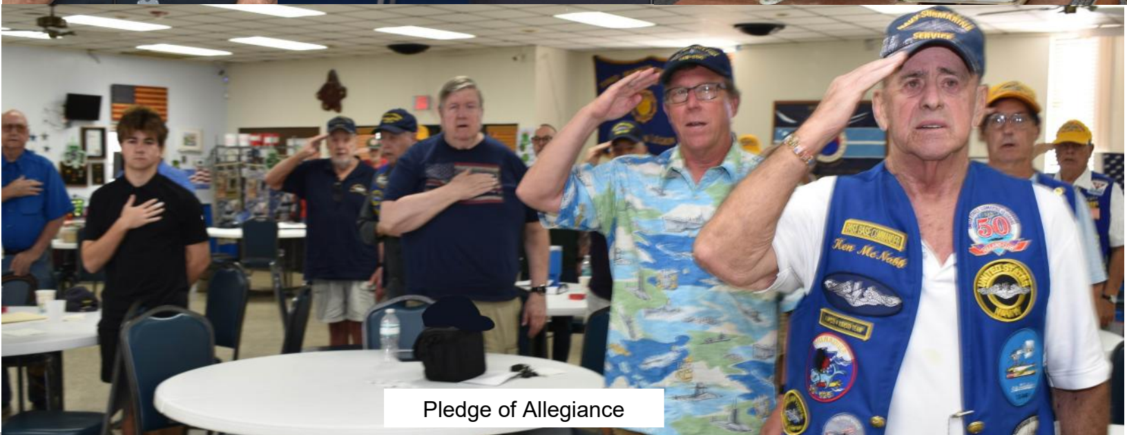
Pledge of Allegiance