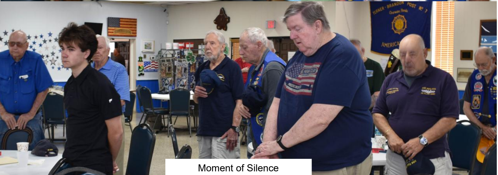
Moment of Silence