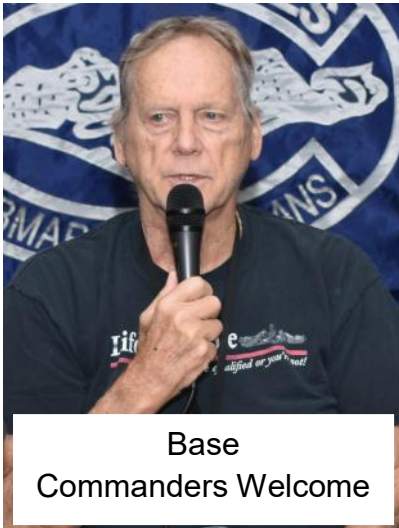
Base Commanders Welcome