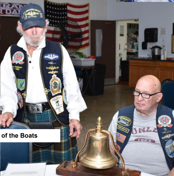
Tolling of the Boats