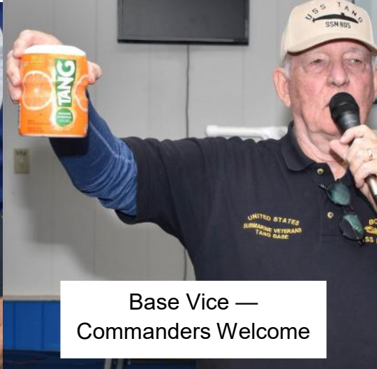
Base Vice — Commanders Welcome