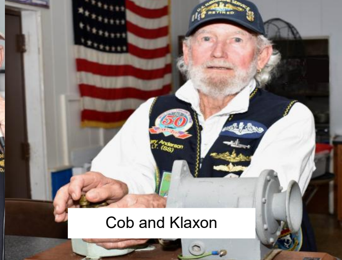
Cob and Klaxon