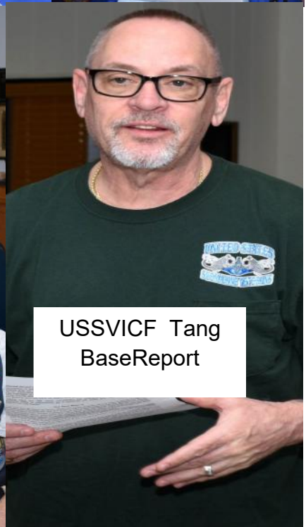
USSVICF Tang BaseReport