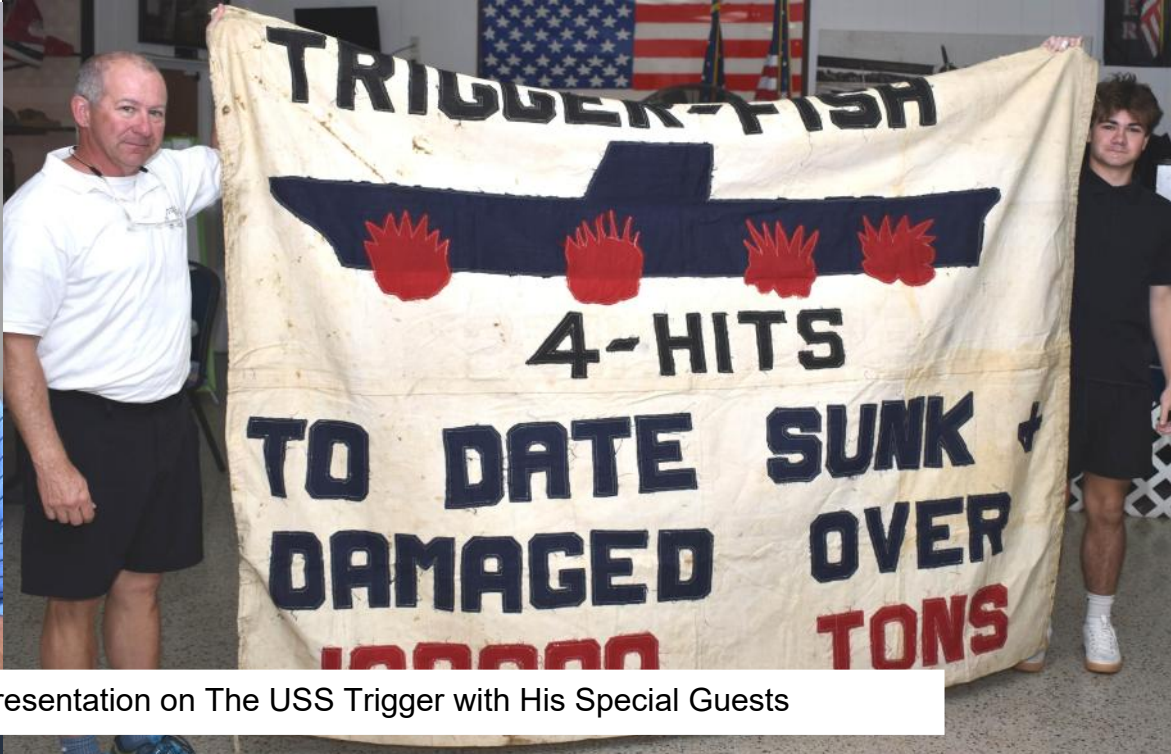
Historian presentation on The USS Trigger with His Special Guests