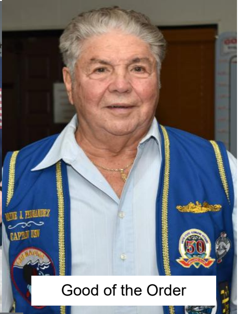
Good of the Order