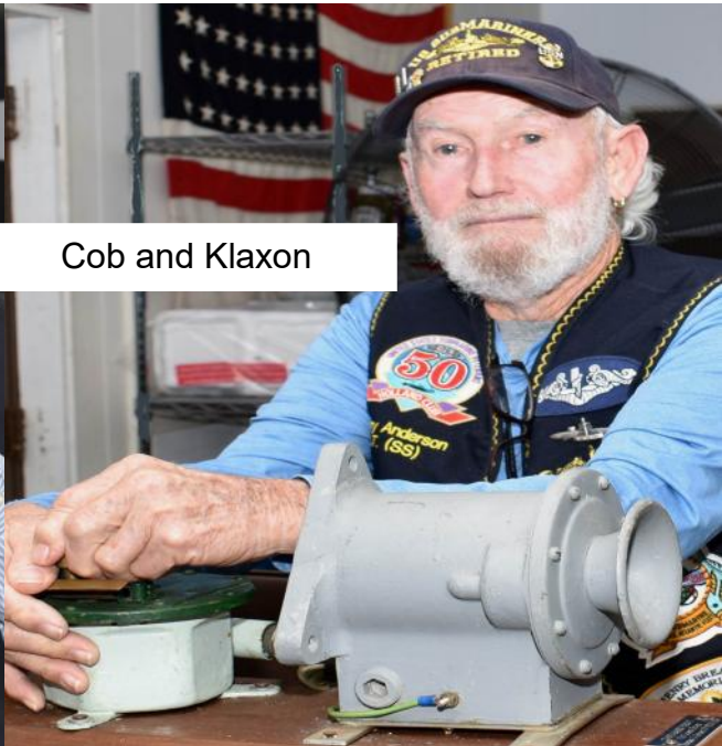
Cob and Klaxon