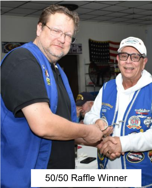
50/50 Raffle Winner