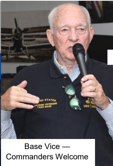
Base Vice — Commanders Welcome