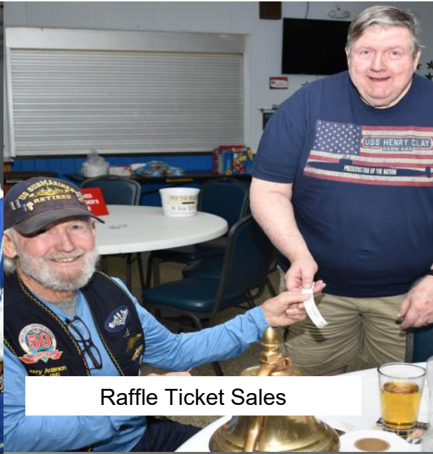
Raffle Ticket Sales