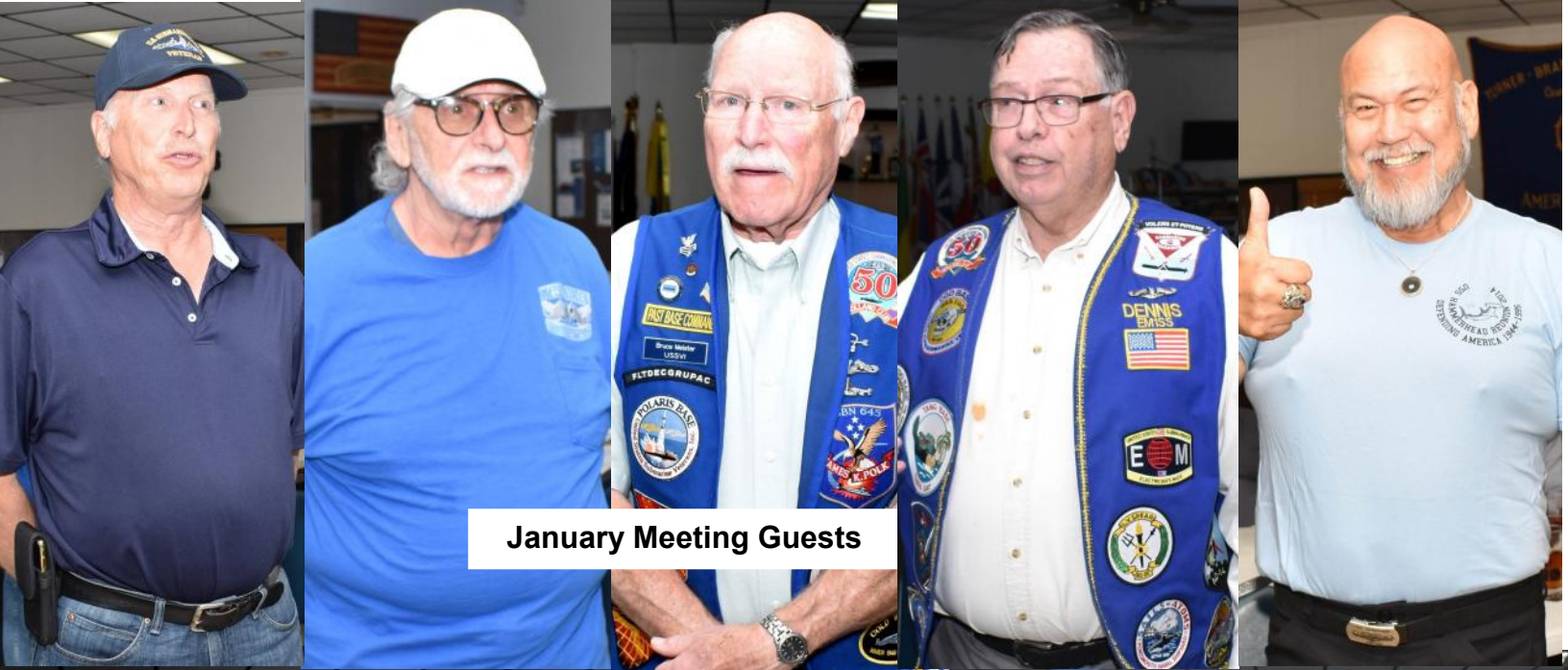
January Meeting Guests