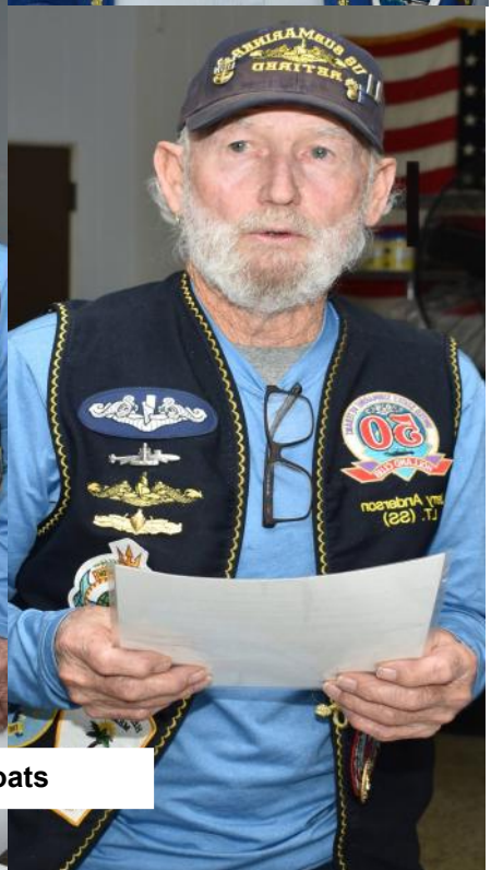
Tolling of the Boats