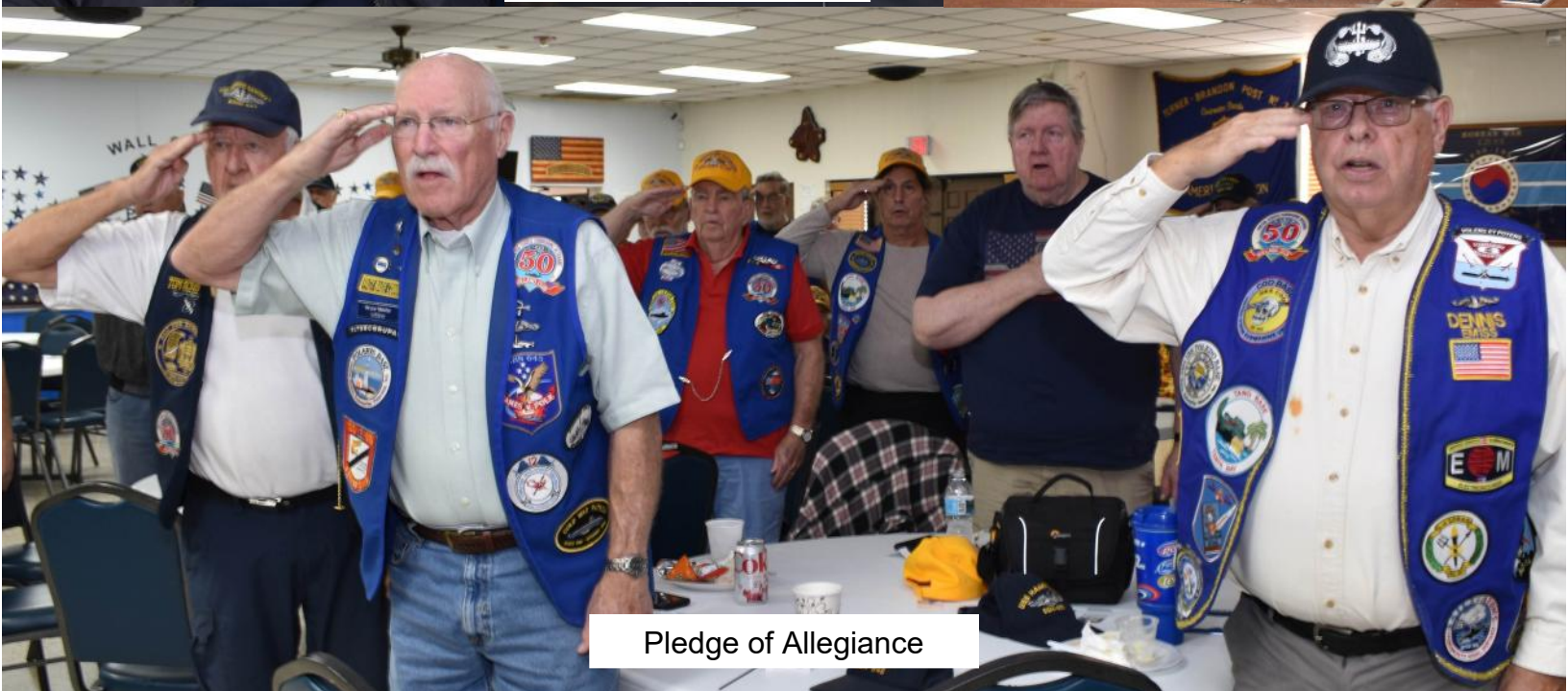
Pledge of Allegiance