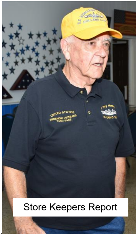
Store Keepers Report