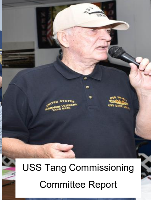
USS Tang Commissioning Committee Report