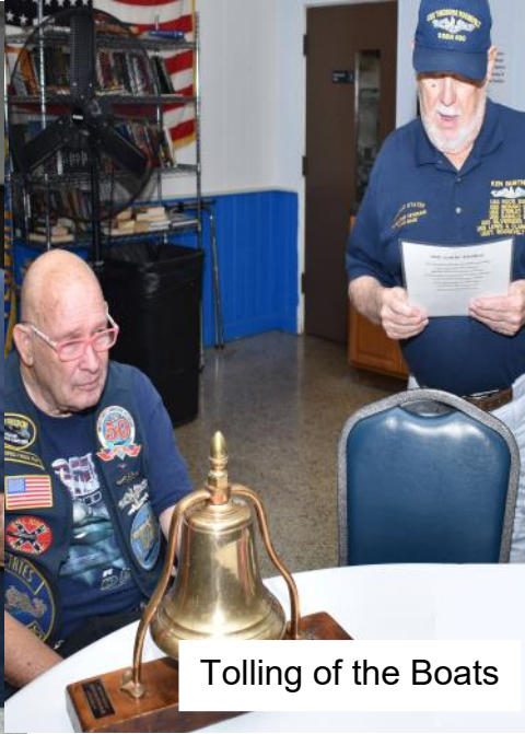
Tolling of the Boats