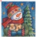
Season's Greetings 2006

Large Split the Pot Saturday Night Raffle (w/extra prizes) - 6 for $5.00