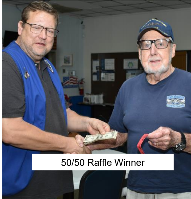
50/50 Raffle Winner