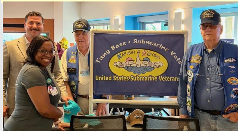
Photo Of the Recent Kaps 4 Kids adventure at St, Joes Children's Hospital. From Sept 13

https://www.youtube.com/watch?v=ZjuzJODdH8Q