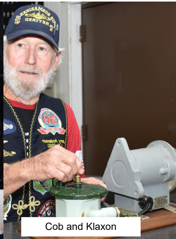
Cob and Klaxon