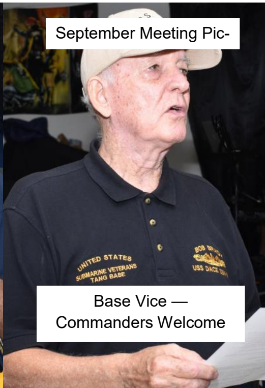
Base Vice — Commanders Welcome