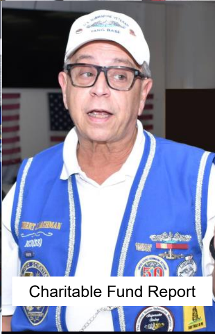
Charitable Fund Report