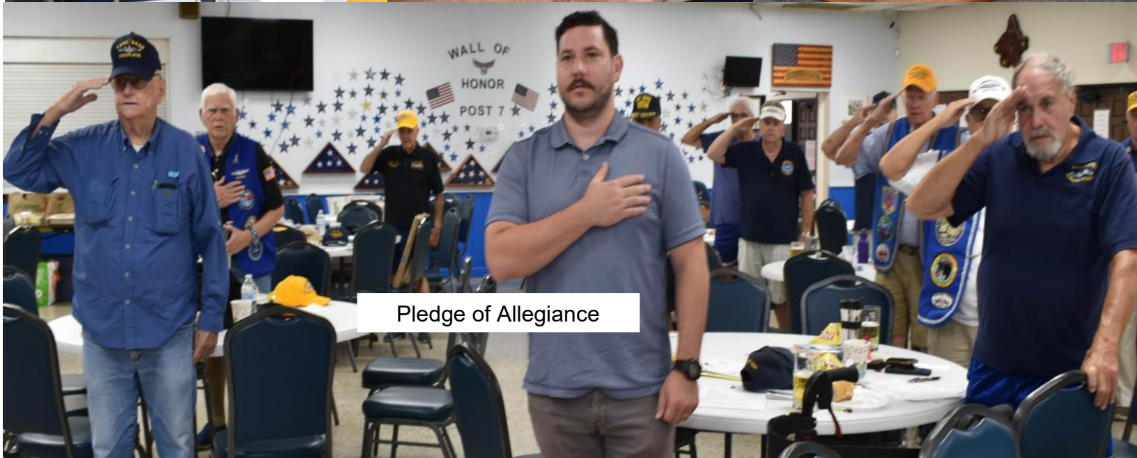
Pledge of Allegiance